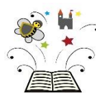
Use your imagination